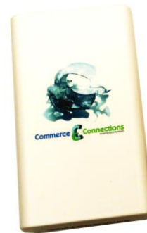
Smart Sensor casing (actual size: 72mm x 124mm x 31mm)

The sensors allow continuous monitoring of temperature and humidity and Commerce-Connections can integrate the data into almost any back-end system. Historic data can be stored for future analysis according to HACCP regulations. Custom alerts can trigger corrective action 24/7 according to user-defined temperature and humidity conditions. Applications reach beyond just food storage specifications, like Project B, the sensor units can be applied to deep-freeze cabinets, restaurant air-conditioning, live organ transport/storage and wine/beer fermentation.